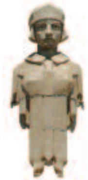
A pair of nurses are located on each corner of the Plummer Building tower, Ellerbe & Company, architect

Attendance at this Mayo course does not indicate nor guarantee competence or proficiency in the performance of any procedures which may be discussed or taught in this course.