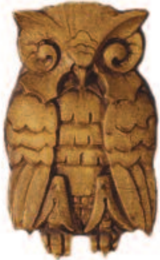
One of three gargoyles projecting from the center of the tower of the Plummer Building; the owl symbolizes wisdom, Ellerbe & Company, architect

Emeritus Consultant* Mayo Clinic Rochester, Minnesota