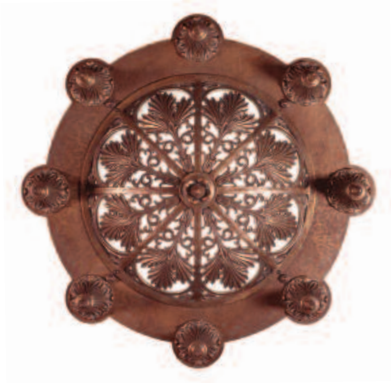
Light fixture in the elevator lobby of the second floor, Plummer Building, Ellerbe & Company, architect