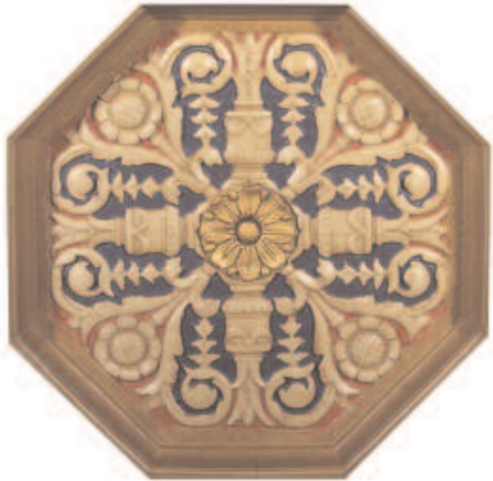
Hand painted ceiling tile from the twelfth floor, Plummer Building, Ellerbe & Company, architect