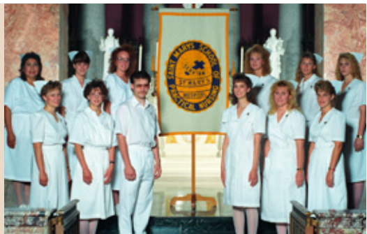
Last class of Saint Marys School of Practical Nursing

A Collaborative Practice Framework is implemented. It results in increased presence of clinical nurse specialists and nursing education specialists to support professional nursing practice.