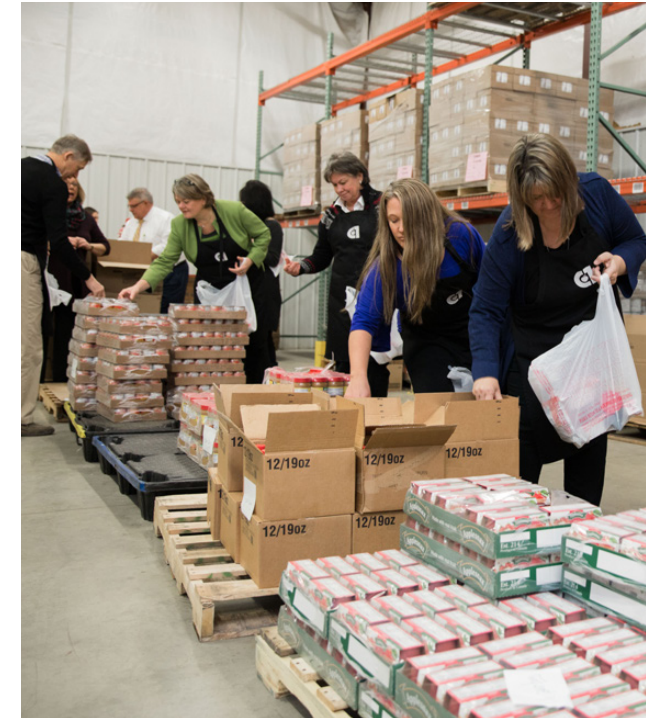
Channel One Regional Food Bank, Mayo's Season of Giving.